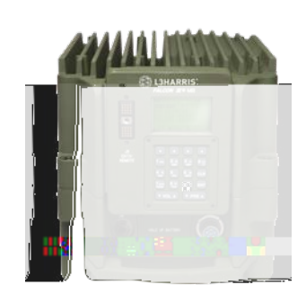
RF-7800V RF-7850M VHF & MB Tactical Vehicle/Base Radios

RF-7800V RF-7850M VHF & MB Tactical Handheld Radios