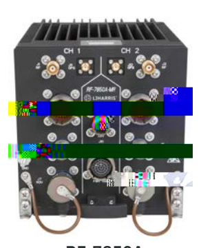
RF-7850A Multi-channel Airborne Networking Radio